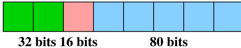
Figure 2-1. The anatomy of an IPv6 address

There are a some specially reserved prefixes, most notable include: